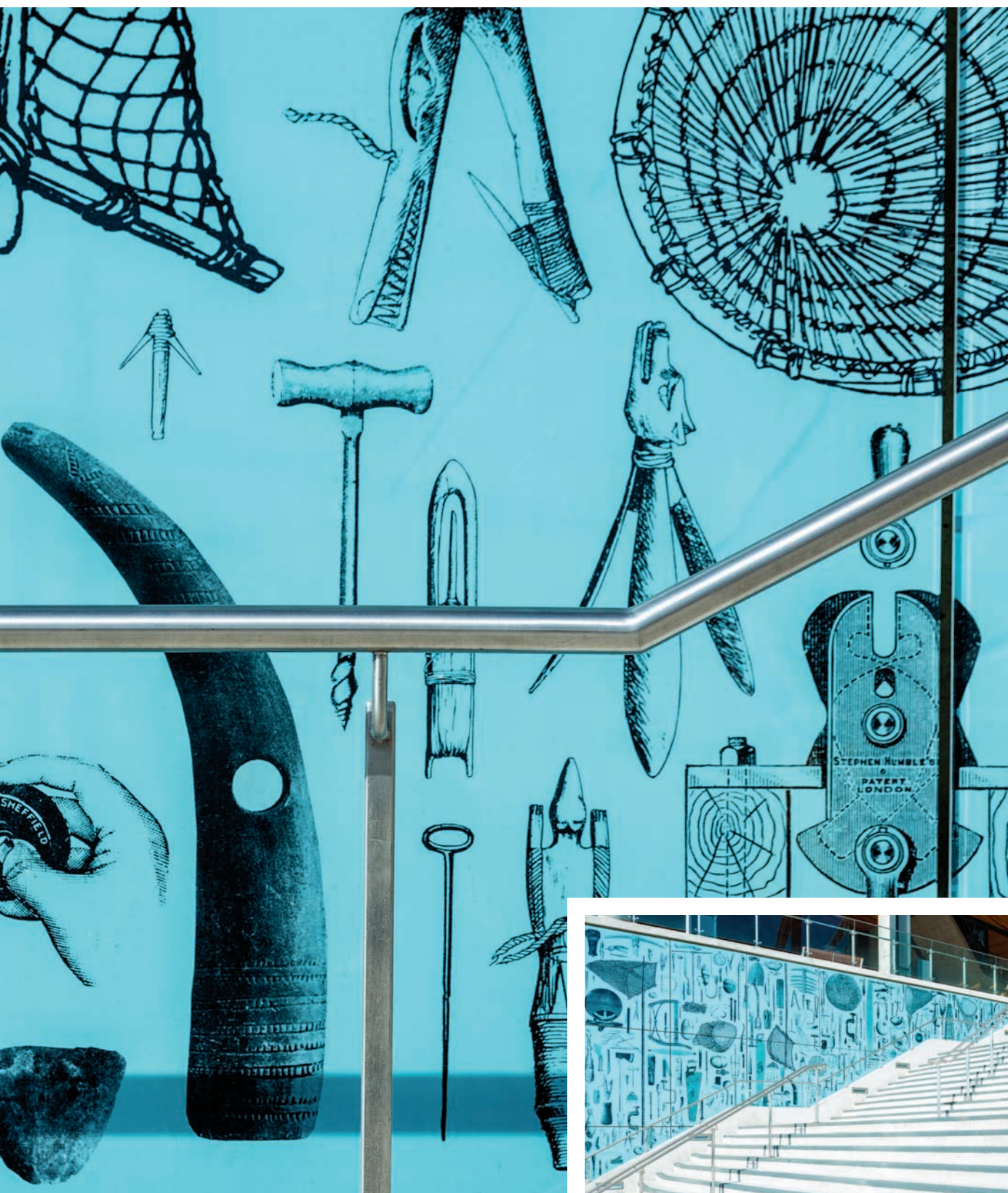
INSTALLATION AT MARINE GATEWAY