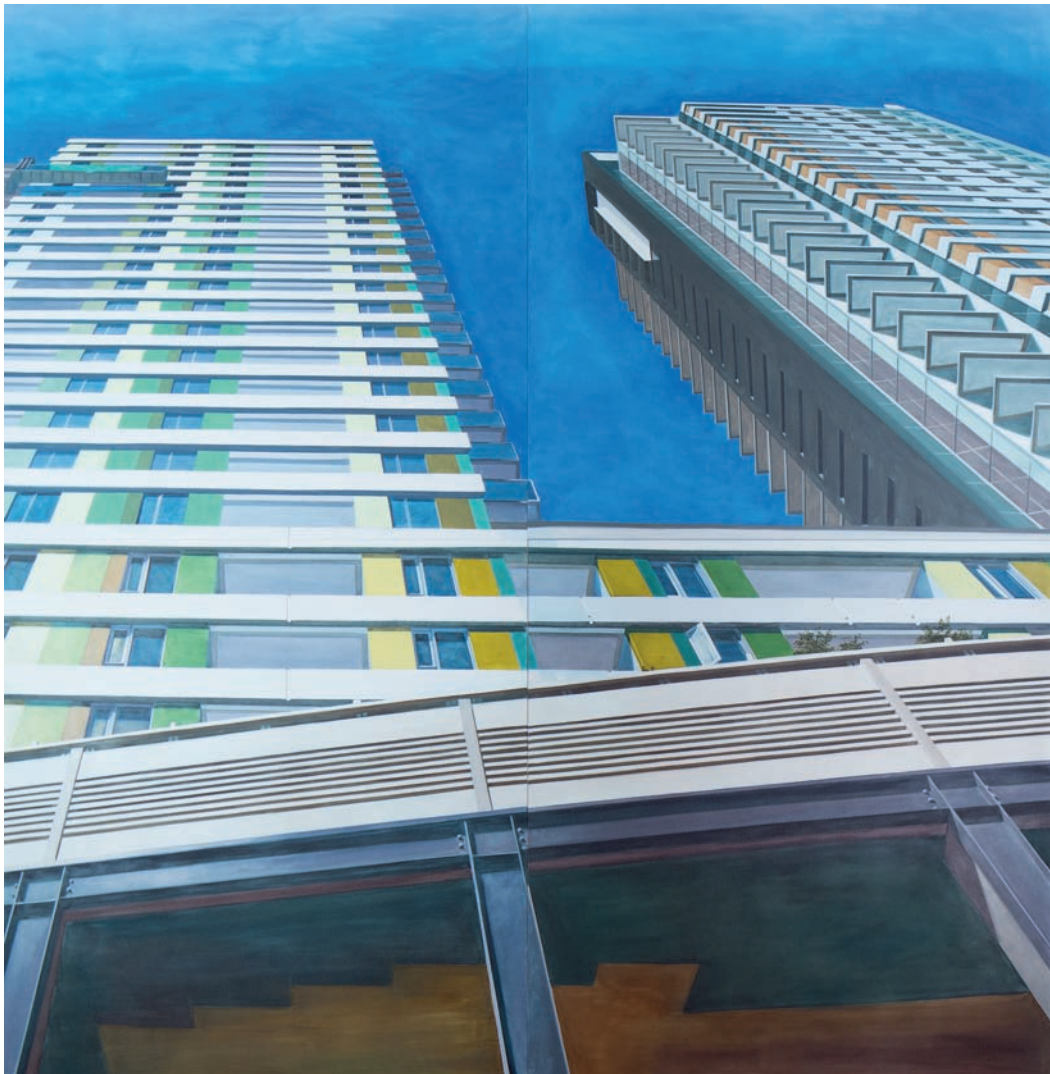
TOP: SOUTH LOBBY, 144" X 72", BOTTOM: NORTH LOBBY, 144" X 144"