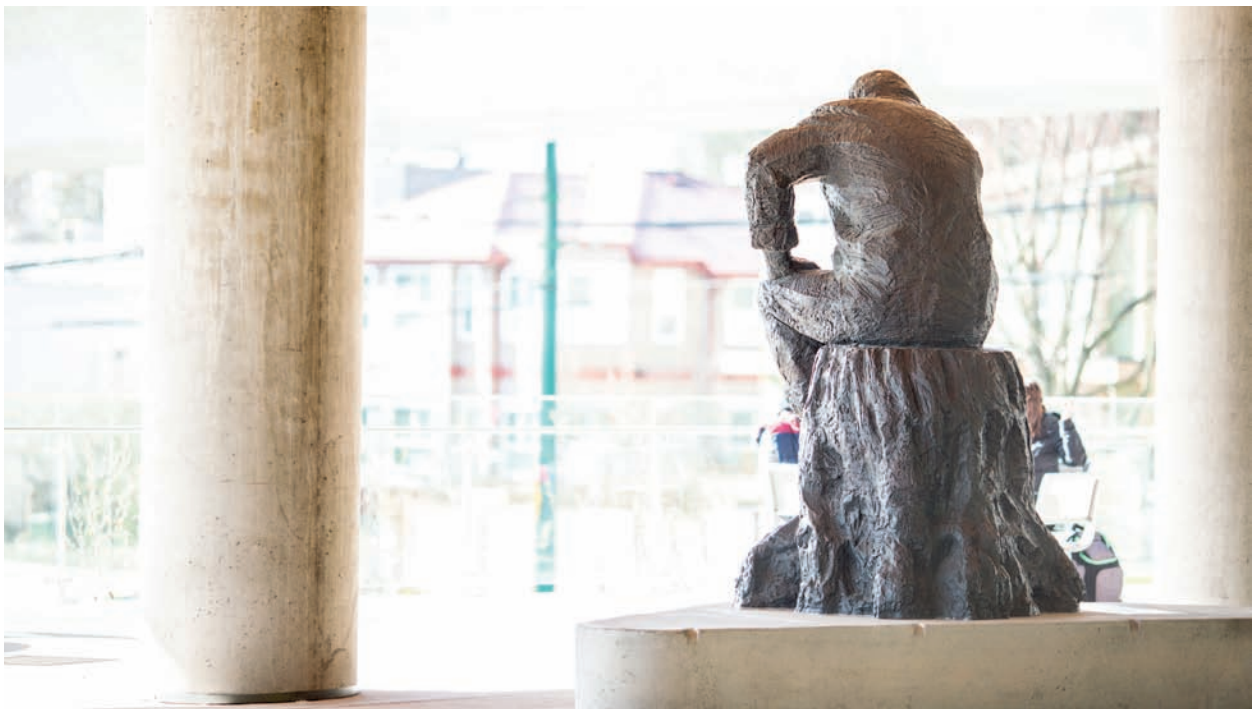
SIMON FRASER BY KEN LUM